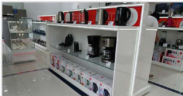
Shop: SF-004, II Floor, Zabeel Expansion, Dubai Mall