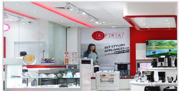
Al KhanMall - Matajer - Al Khan – Sharjah