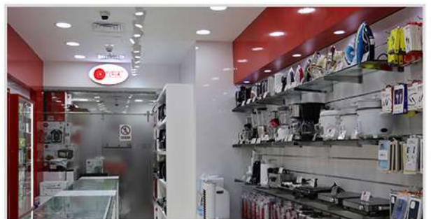
Al Ghurair Center, Opp. Carrefour 1st Floor, Deira - Al Rigga - Dubai