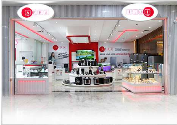
Shop No 39, Ground Floor, Bin Shabib Mall - Al Qusais 1 – Dubai