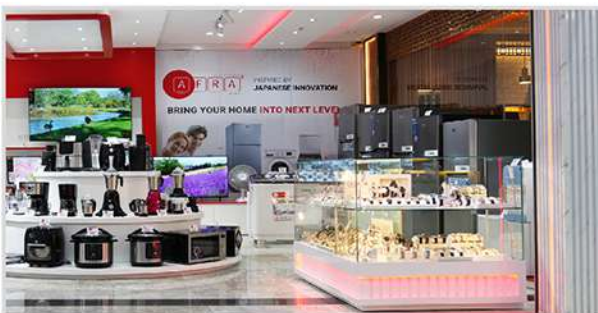
Bin Shabib Mall - Al Barsha - Al Barsha South – Dubai