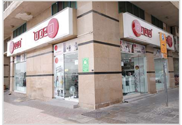
Shop No 8, Shaikh Latifa Building, Creek Road Deira, Dubai, U.A.E