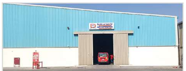
HP26+VX - Umm Dera - Umm Al Quwain