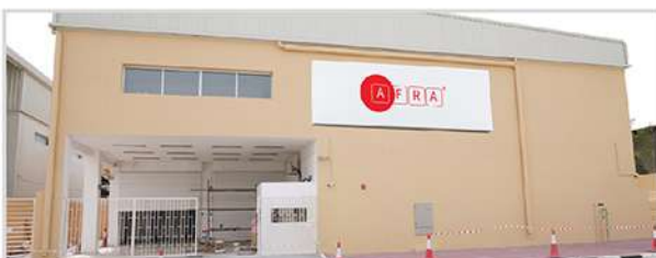
28 33th D St - Umm Ramool - Dubai